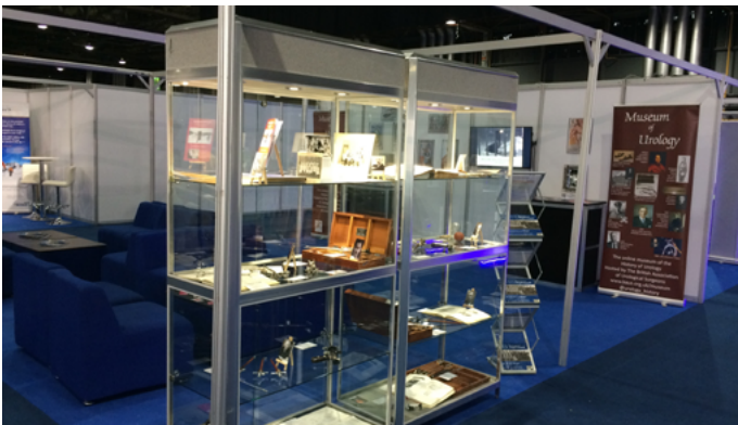
Figure 1 The History Display at BAUS 2019 in Glasgow.

The Museum of Urology History Display at BAUS London 2026 will be sponsored by Karl Storz UK, a company closely associated with the history of endoscopy. I'm looking forward to bringing the History Display back to BAUS this year and to seeing you all there.