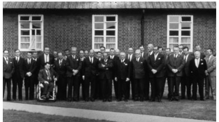
Figure 2 BAUS visits Stoke Mandeville Hospital in 1945.